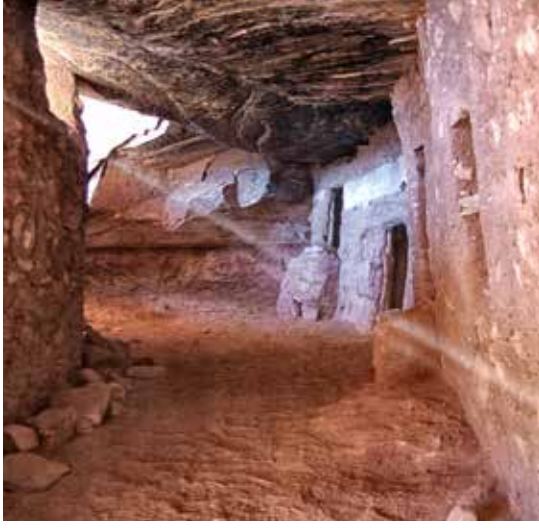
Sunlight beams through small openings in the wall of the Moon House. Although they don't correspond to obvious lineups or markings, the sunbeams lend a touch of mystery to an already enigmatic site.

crescents. Other than the Moon, only melon slices and fingernails come to my mind. Simonis also knew that the Moon House was one of the best dated archaeological sites in southwestern Utah. Because its construction contained a lot of wood, researchers could count tree rings. When he saw the maps of the 1257 and 1259 eclipses, he thought of the Moon House because it contained wood that was harvested from trees between 1250 and 1268. It was apparently built during the time of these eclipses, so the builders must have witnessed them. After I returned from the Pecos Conference, I immediately went onto the NASA eclipse website and learned that the Moon House was just west of the path of totality in 1259. It was a late October