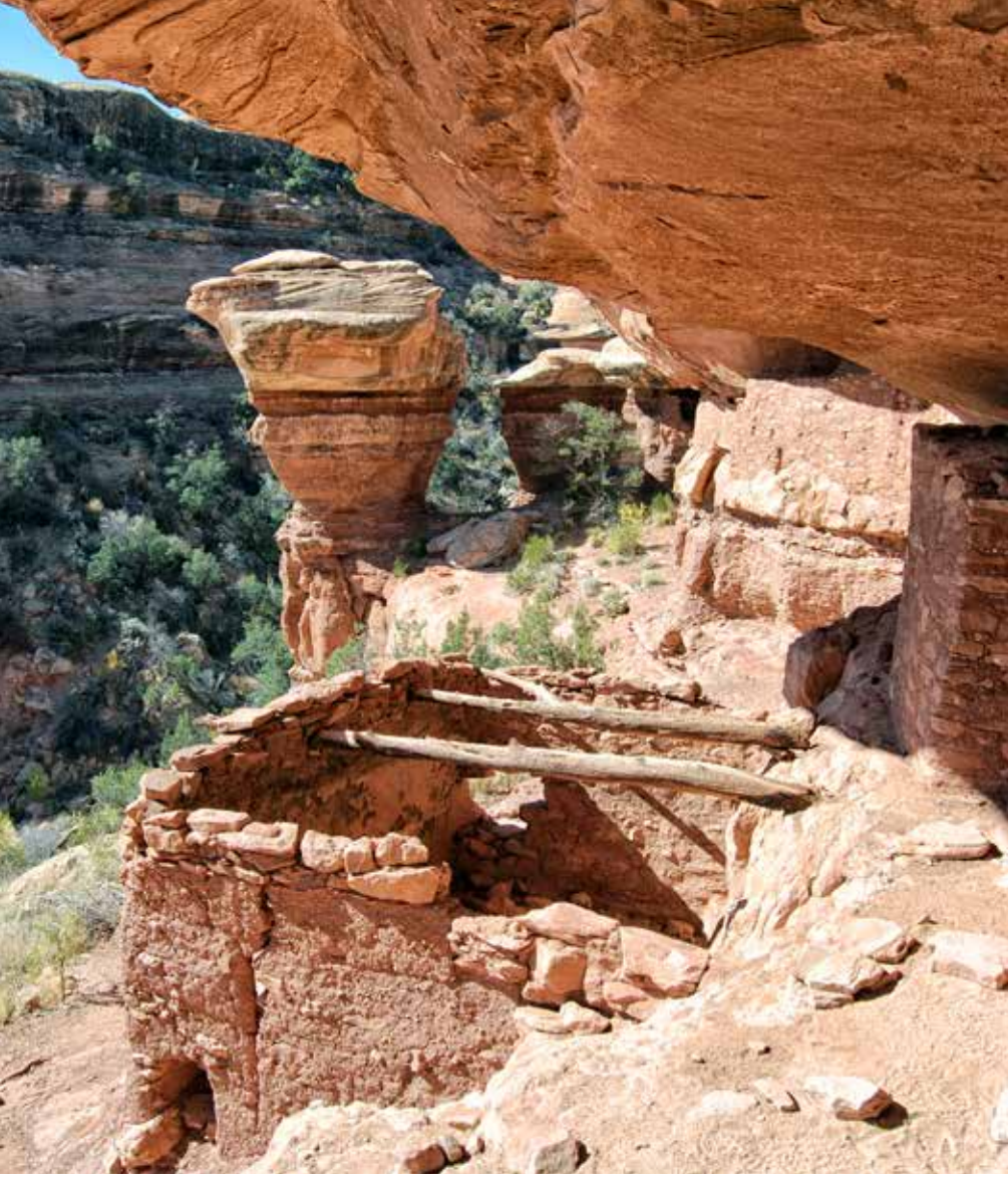
Above: The outer wall of the Moon House stands beneath an overhanging cliff that has helped to protect the interior from wind and rain. Left: Getting to the Moon House isn't easy. As you approach it, you'll see old wooden support beams spanning the gaps between rocks.

experience. And because those cycles were the keys to their survival, they paid attention to the slightest detail and any variation in the pattern.