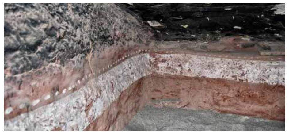
The ancestral Puebloans decorated the walls of one of the inner rooms with evenly spaced dots. At each end is a shape (not pictured) that could depict a crescent Moon or partially eclipsed Sun.