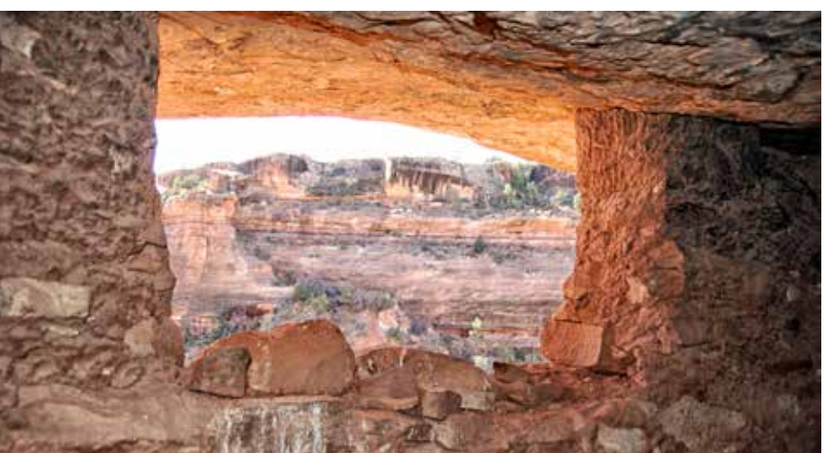
Top: The Moon House is larger than it appears when you view it from the outside. The interior has areas for living, storage, and meetings. Above: Visitors can see many colorful vistas from inside the Moon House, and the closer you get to the entrance, the more the sky comes into view.

And then one evening, the glowing orb stopped moving south. Across the mesas, that last beam of sunlight shone through a natural V in the rock, lighting up a spot on a nearby wall. Somebody pecked a spiral into the desert varnish as a reminder of where the beam would be on this day of celebration of the return of the Sun — the winter solstice.