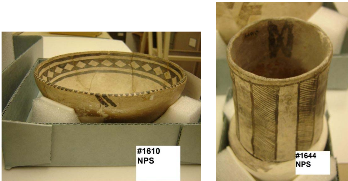
Figure 2: Examples of maker's marks found on whole vessels.

The attributes recorded for each whole vessel and sherd showing a maker's mark included stylistic classification of design, form type, the location of the maker's mark on the vessel, and the design of the maker's mark itself. When originally going through the samples, I looked for any designs that were obviously not a part of the overall decoration style of the vessel on the unpainted exterior rims of bowls, the unpainted interior rims of jars, and the bases of all vessels. Any markings on these surfaces that did not match the overall vessel designs were recorded as marker's marks and photographed. The recorded designs included mostly those done in black paint, but a few designs were painted using a white slip on the unslipped surface of the vessel.