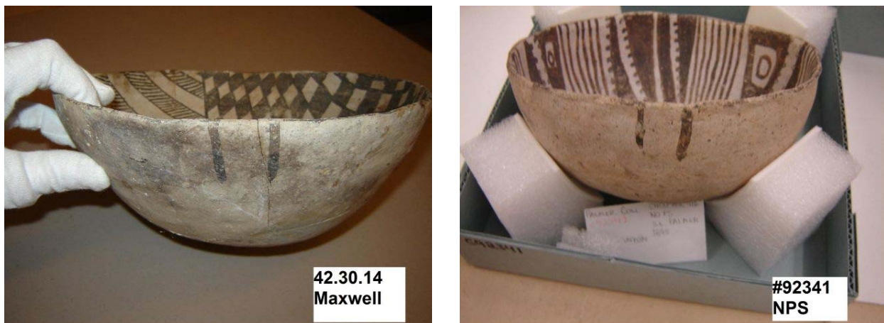
Figure 3: Examples of extended rim lines excluded from study results.

marks that I had originally thought might be maker's marks appeared to be only mistakes, or marks that had occurred as a result of a brush slip while painting a band around the rim of a vessel. In addition, there were seven whole bowls and three bowl rim sherds that all had two parallel lines extending perpendicular to the rim about one or two inches on the vessel exterior (figure 4). Initially, I had thought this might be a recurring maker's mark. With more attention, I noticed that all of these double-lined marks were actually extensions of the solid bands painted around the rim of these vessels, on all of which the rim was left unpainted between the two downward-extending lines. This appears to be significant and unique to only the vessels with solid rim lines, and not ticked rims. It has been suggested (Patricia L. Crown- personal communication, 3/06; Thomas C. Windes- personal communication, 4/06) that these marks are linked to similar line breaks on historic Pueblo ceramic vessels. I excluded all examples of these extended rim lines from my results and do not consider them to be maker's marks, but instead an integral and symbolic part of the design for the vessels on which they occur.