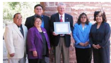
At Zuni Pueblo.