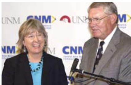
UNM/CNM partnership announcement