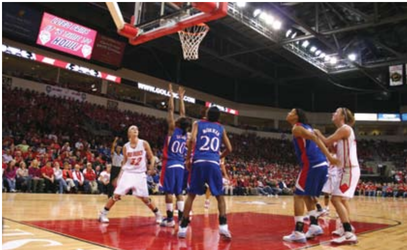
The Lobos' sweet ride through the Women's National Invitational Tournament came to an end when they fell to Kansas 78-69 at the Santa Ana Star Center.

Alford was also named the 2008-09 Mountain West Conference Coach of the Year after leading the Lobos to a share of the league title.