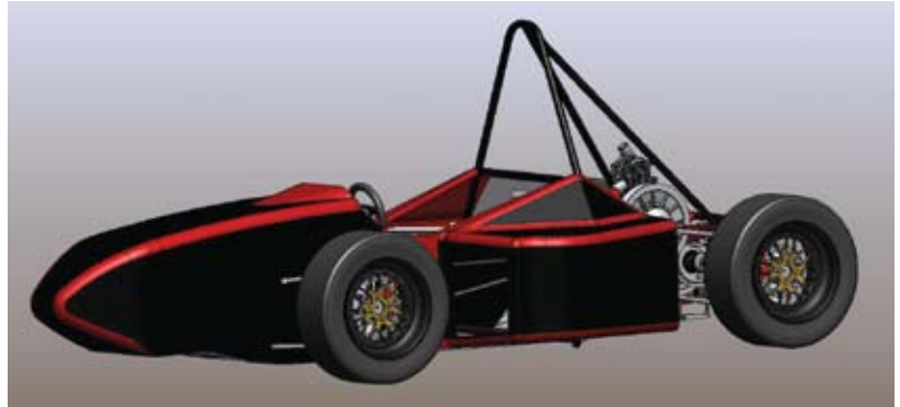
Design model of the 2009 UNM School of Engineering FSAE race car