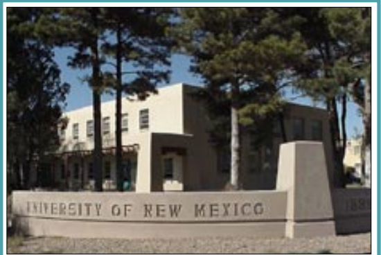
The Communication and Journalism building

Faculty members, however, believe that the accrediting process has worth as an external check on the program and have expressed a strong interest