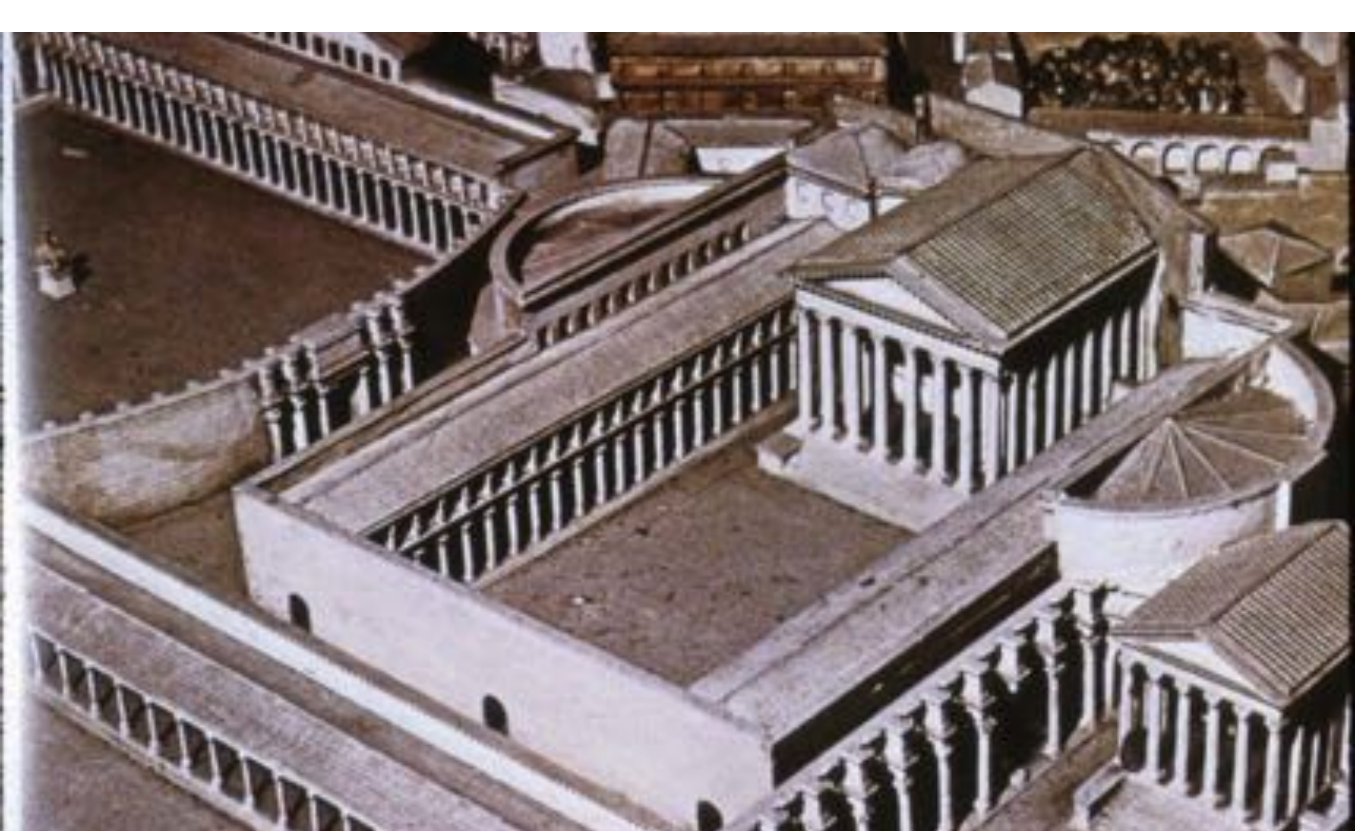
Forum of Augustus with Temple of Mars Ultor.