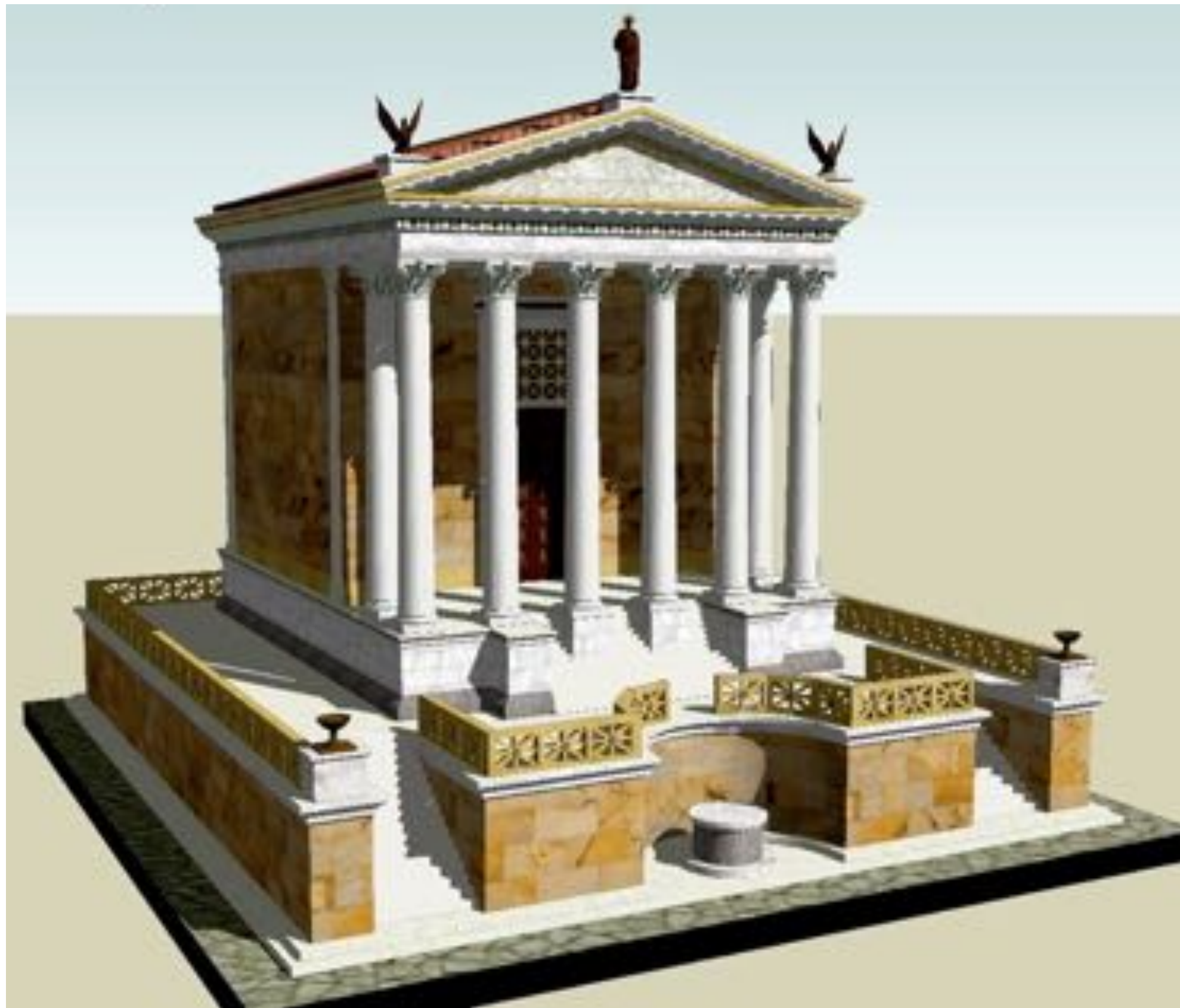
Temple of Caesar