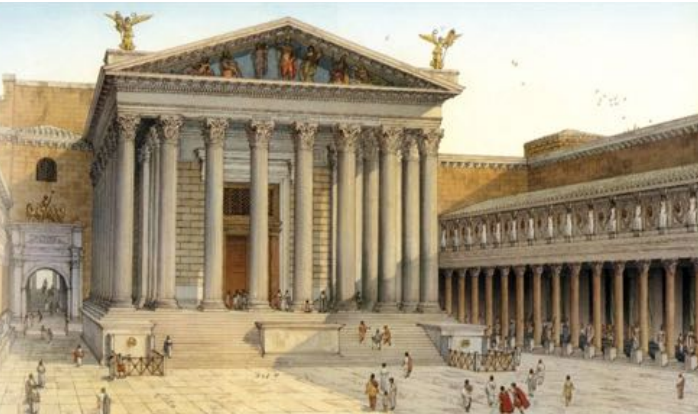
Forum of Augustus with Temple of Mars Ultor.