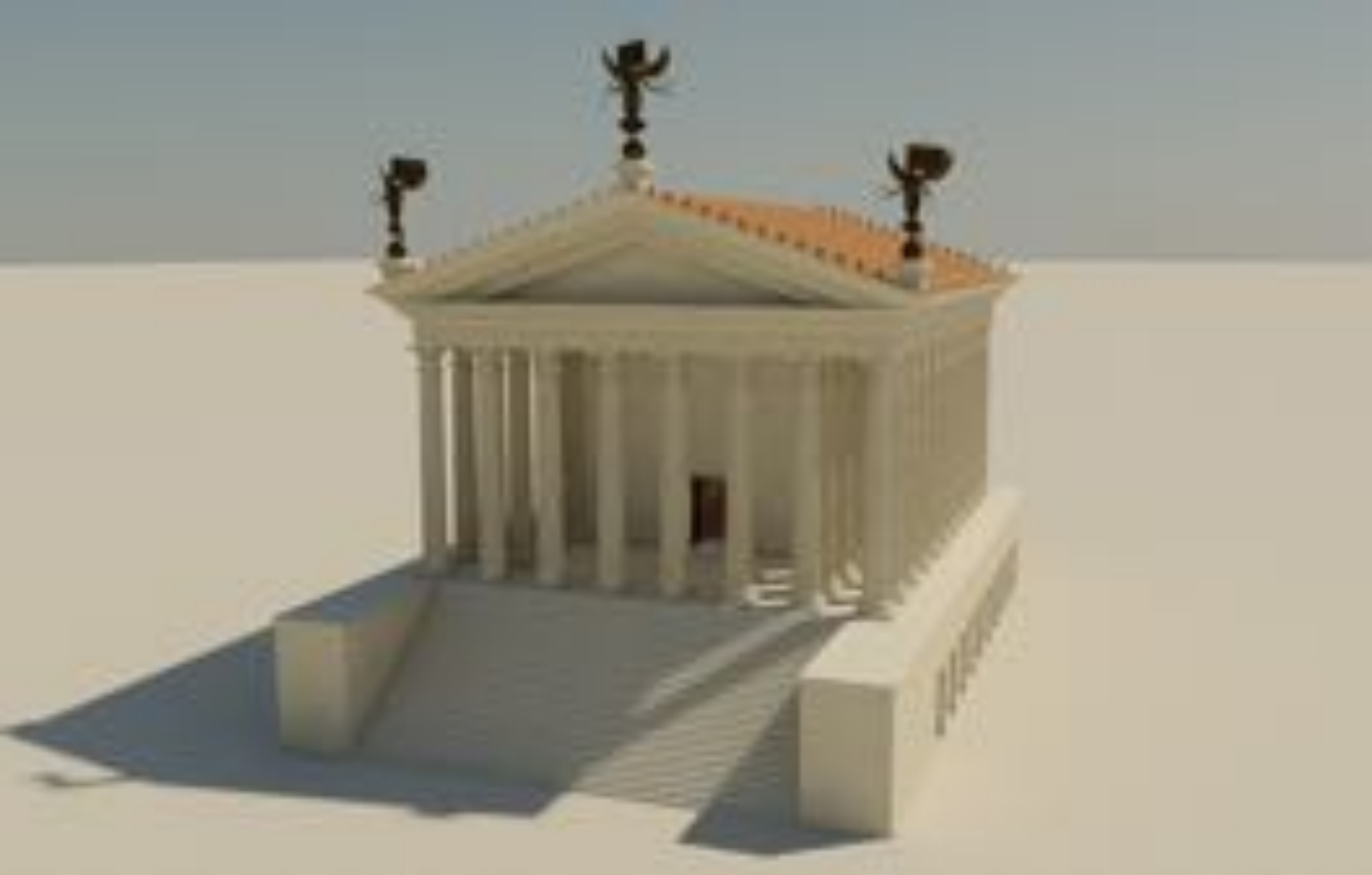
Temple of Castor and Pollux