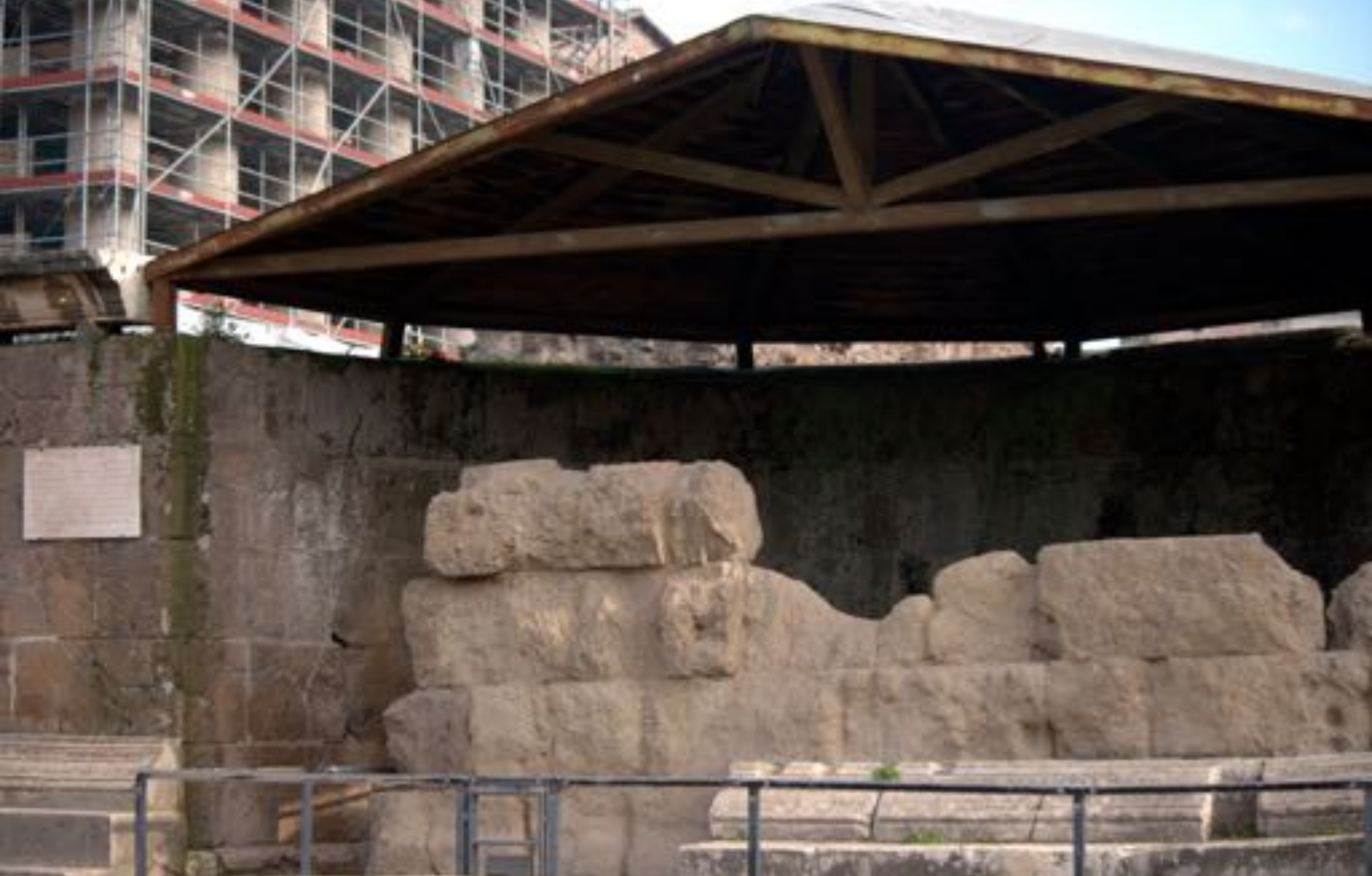
Temple of Caesar