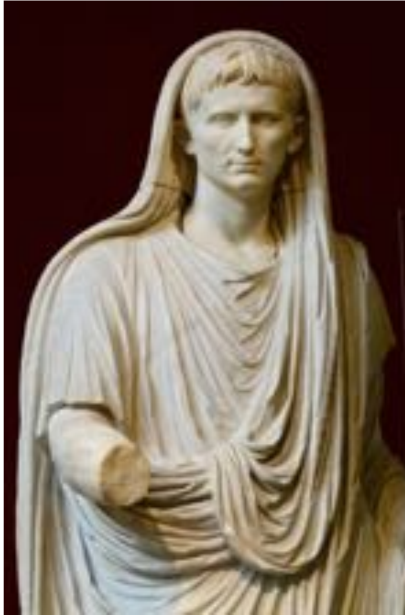
Augustus as Pontifex Maximus