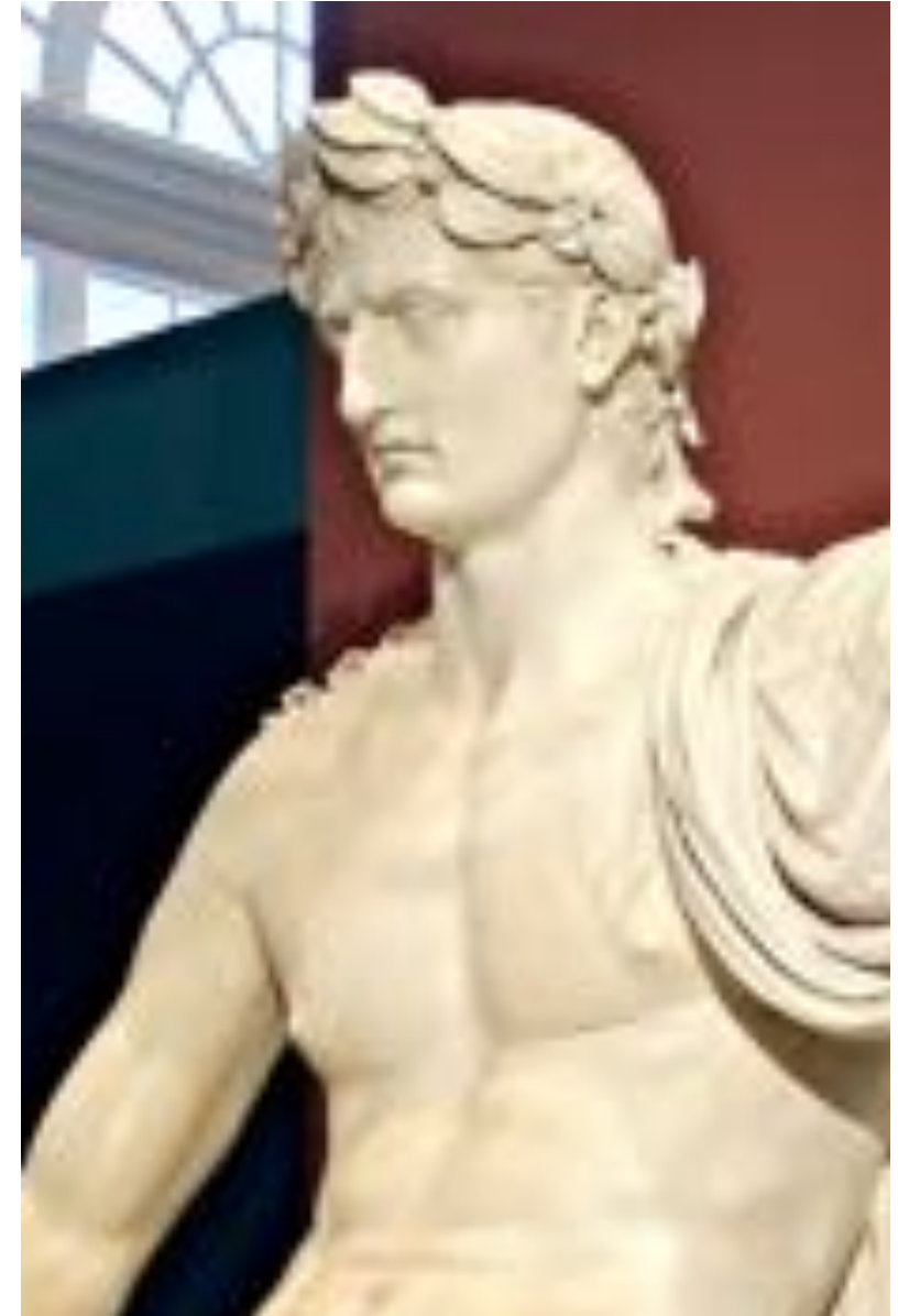
Augustus as Jove