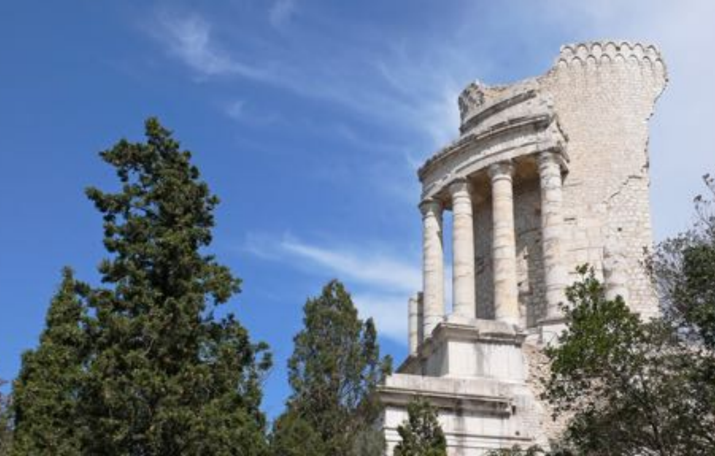
Trophy of the Alps