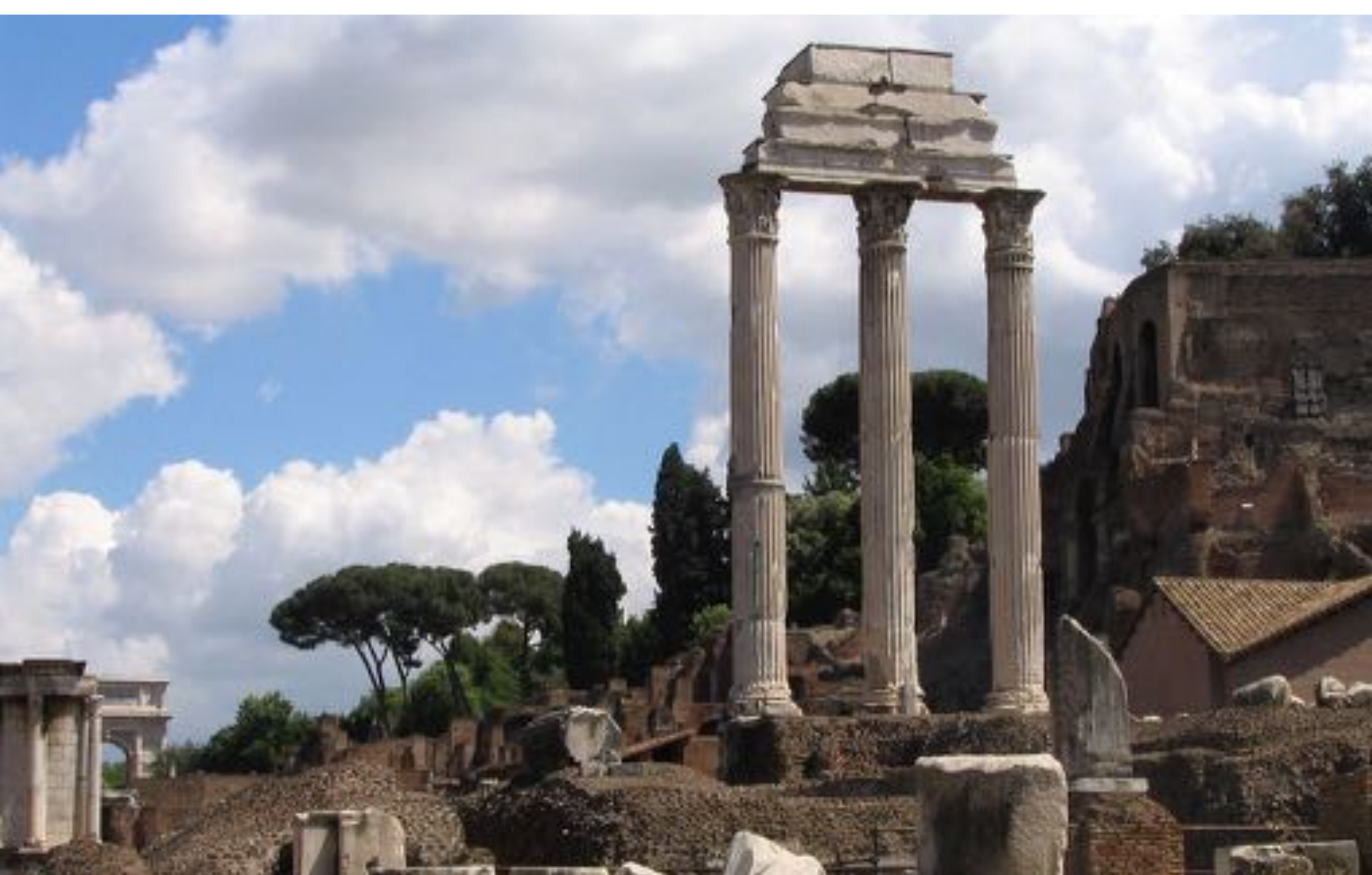
Temple of Castor and Pollux