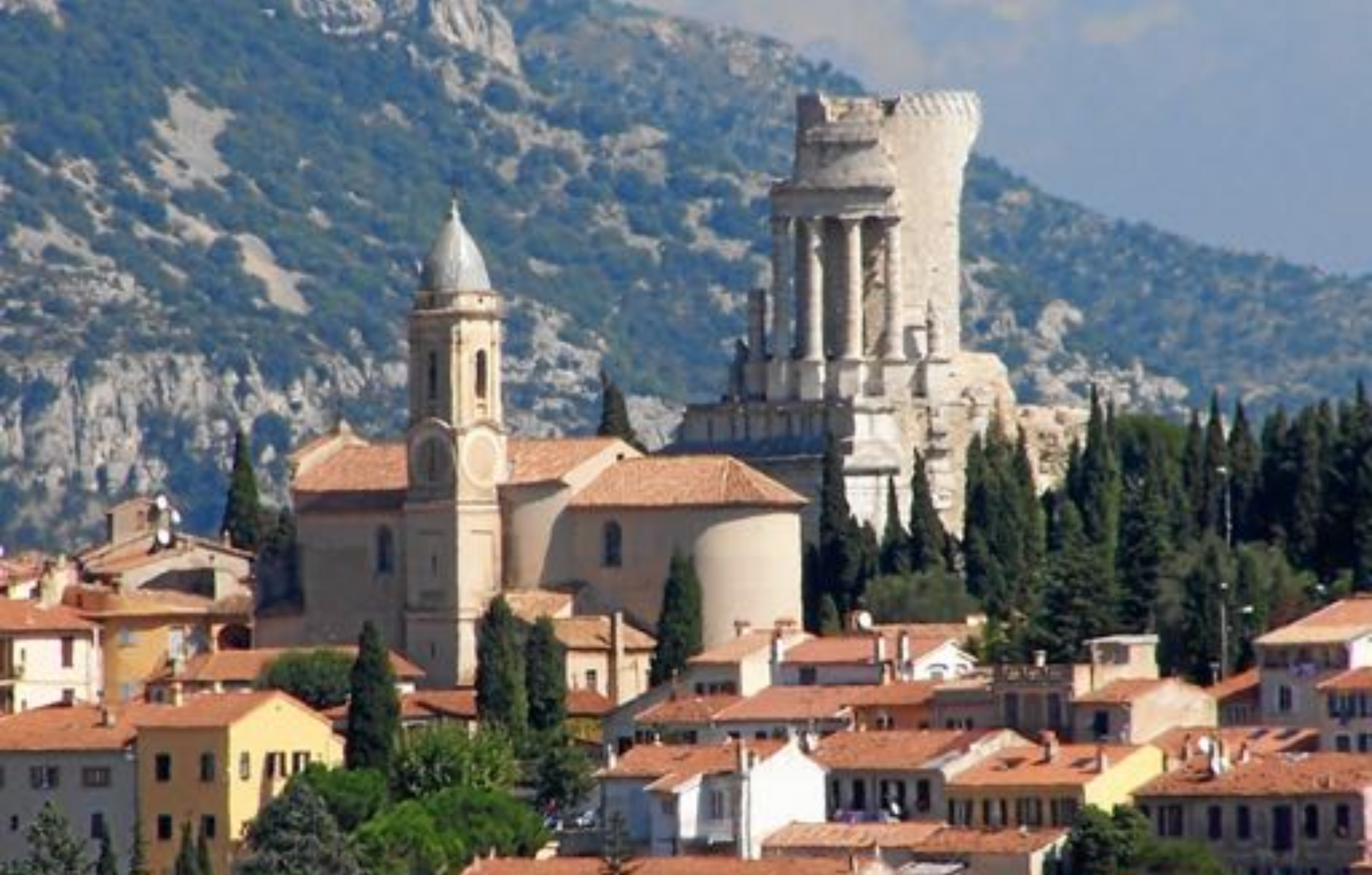
Trophy of the Alps