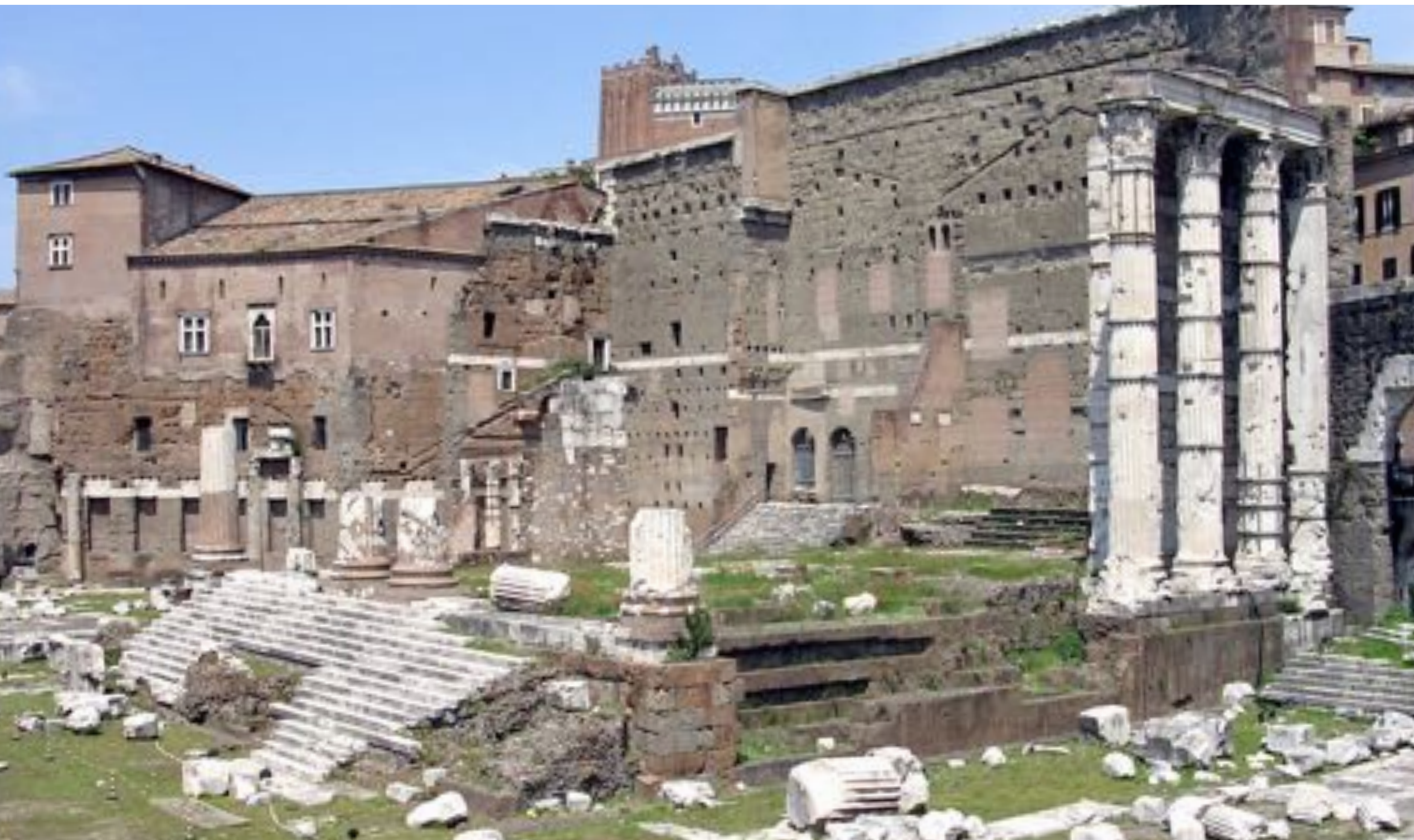
Forum of Augustus with Temple of Mars Ultor.