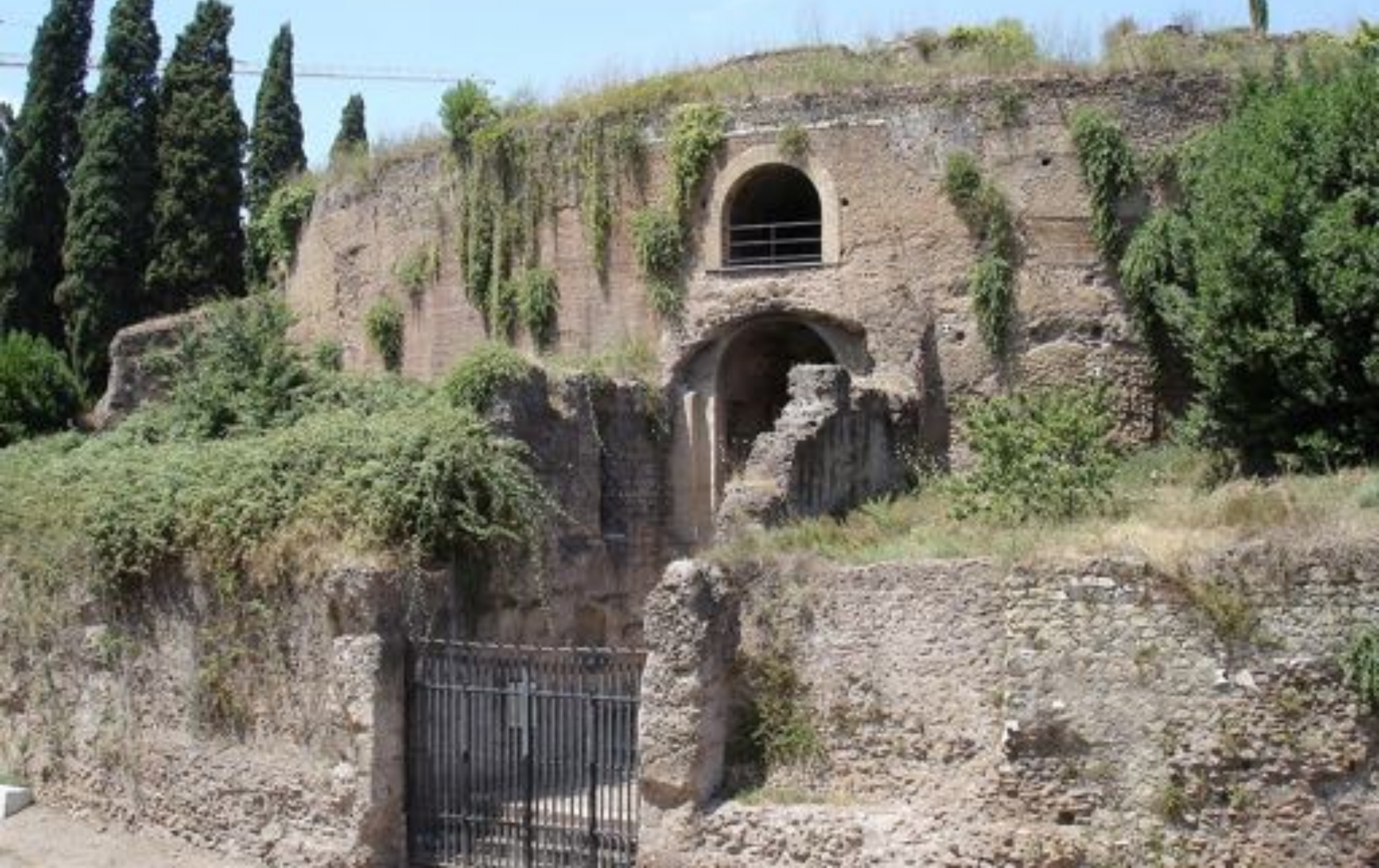
Mausoleum of Augustus