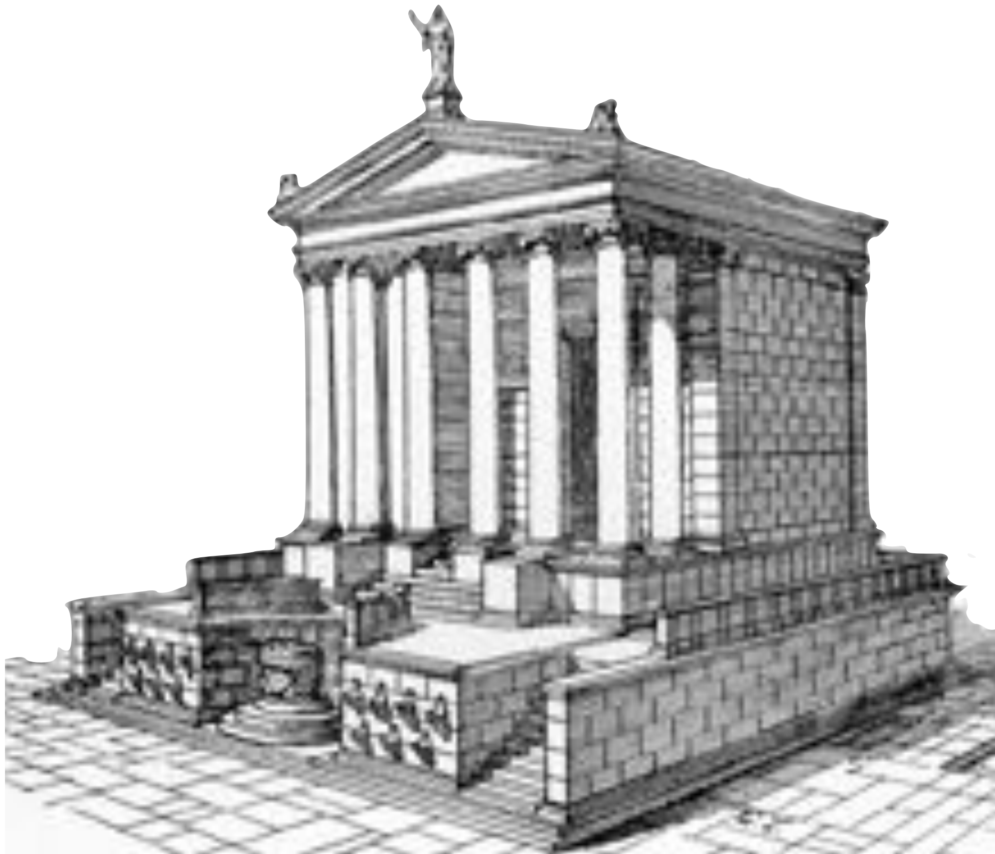
Temple of Caesar