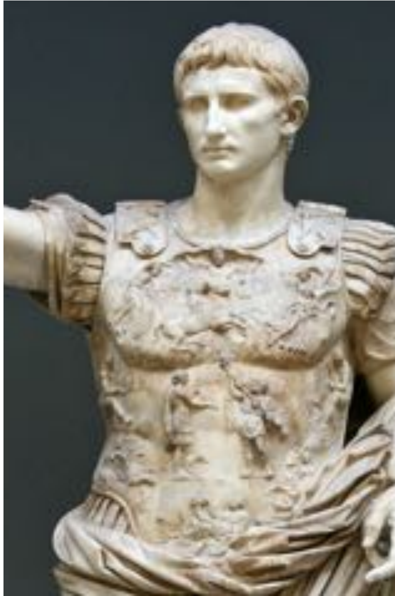
Augustus as Emperor