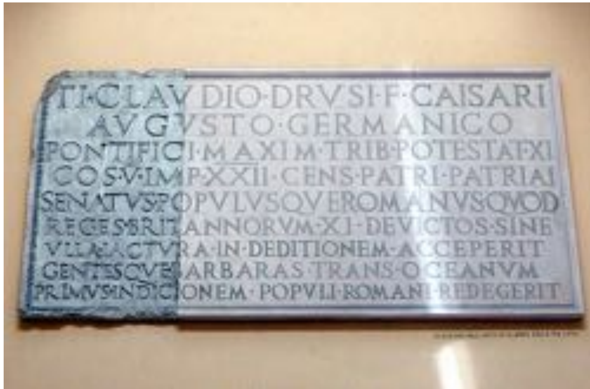
Arch of Claudius