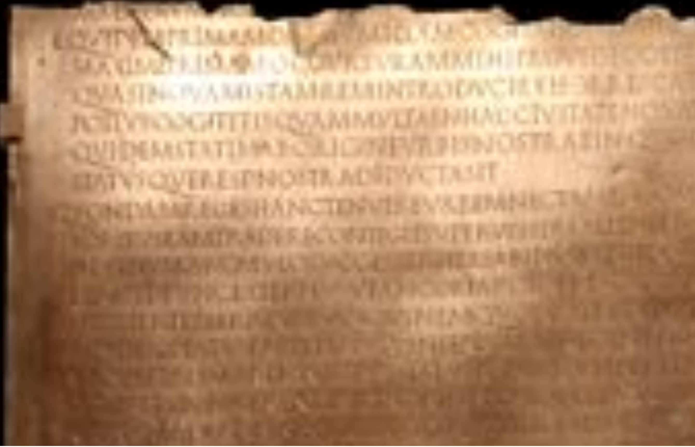
Lyon Tablet, 48