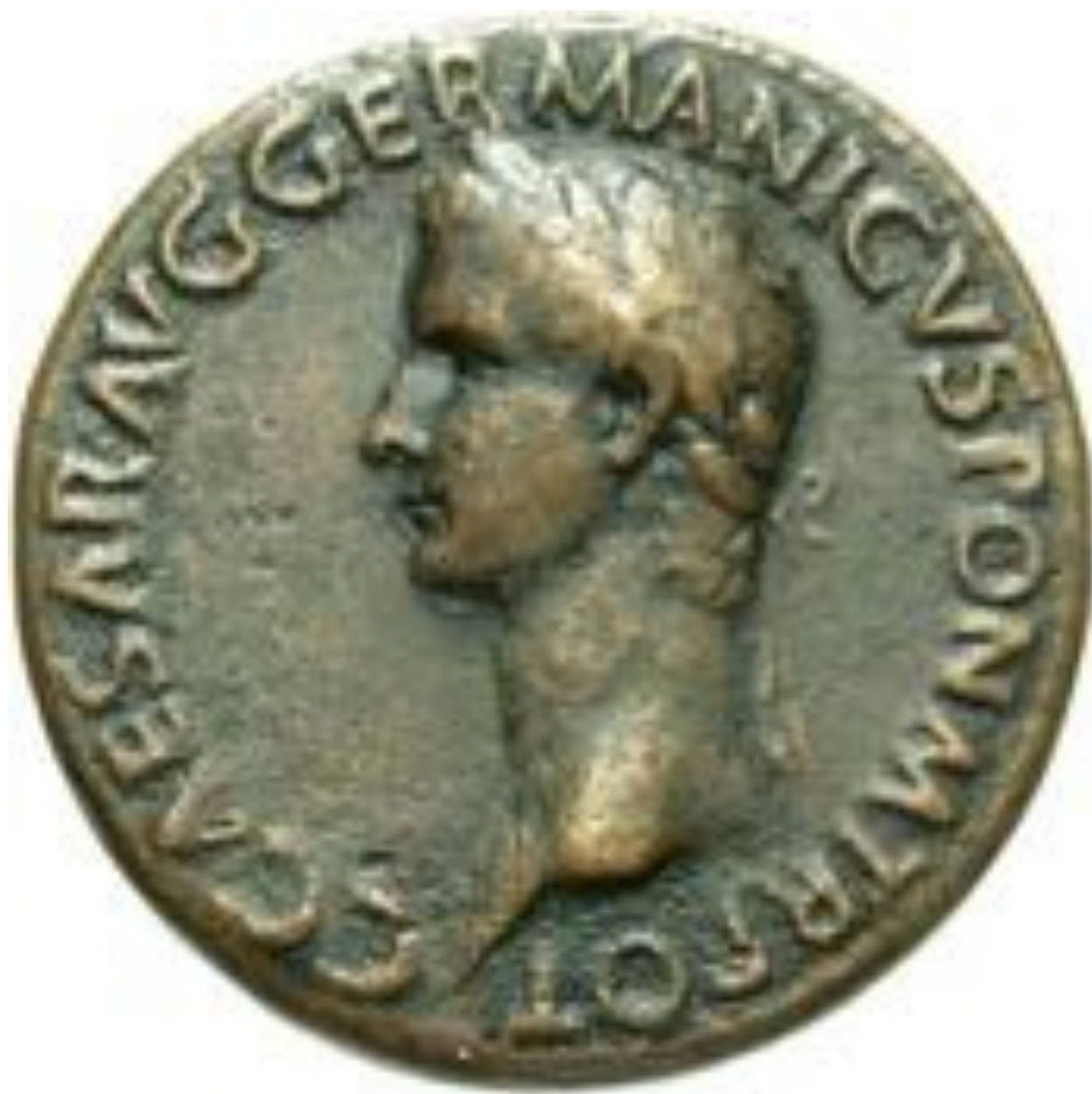
C CAESAR AVG GERM PON M TR POT