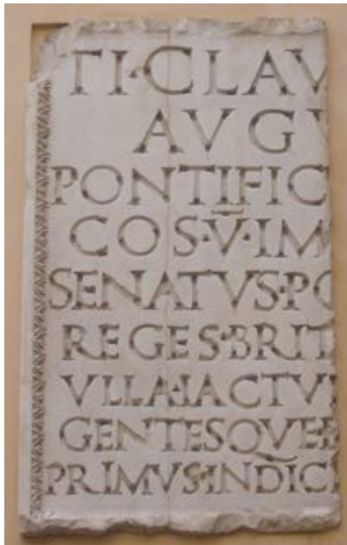
Arch of Claudius