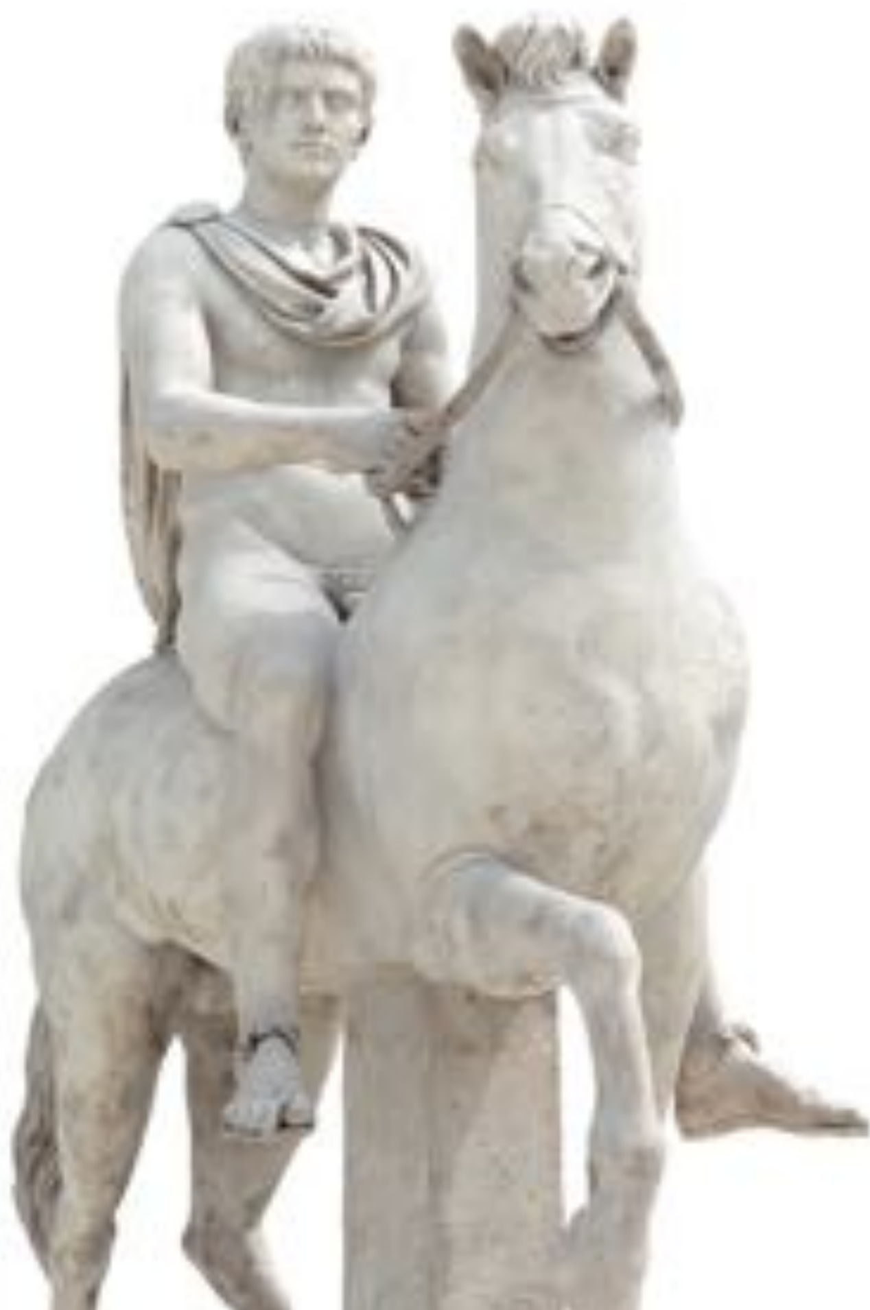
Caligula and Incitatus