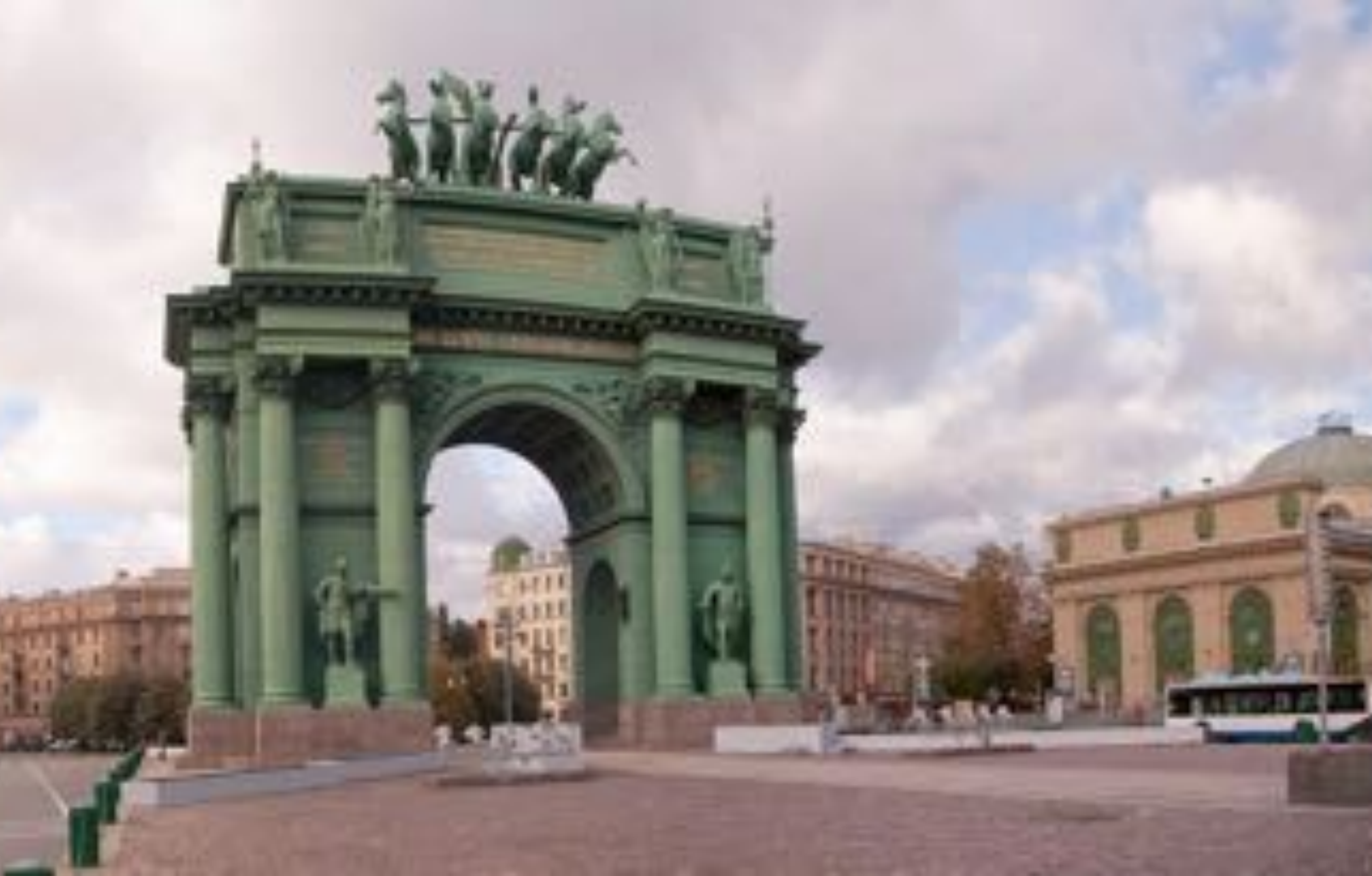
Narva Triumphal Arch, St. Petersburg