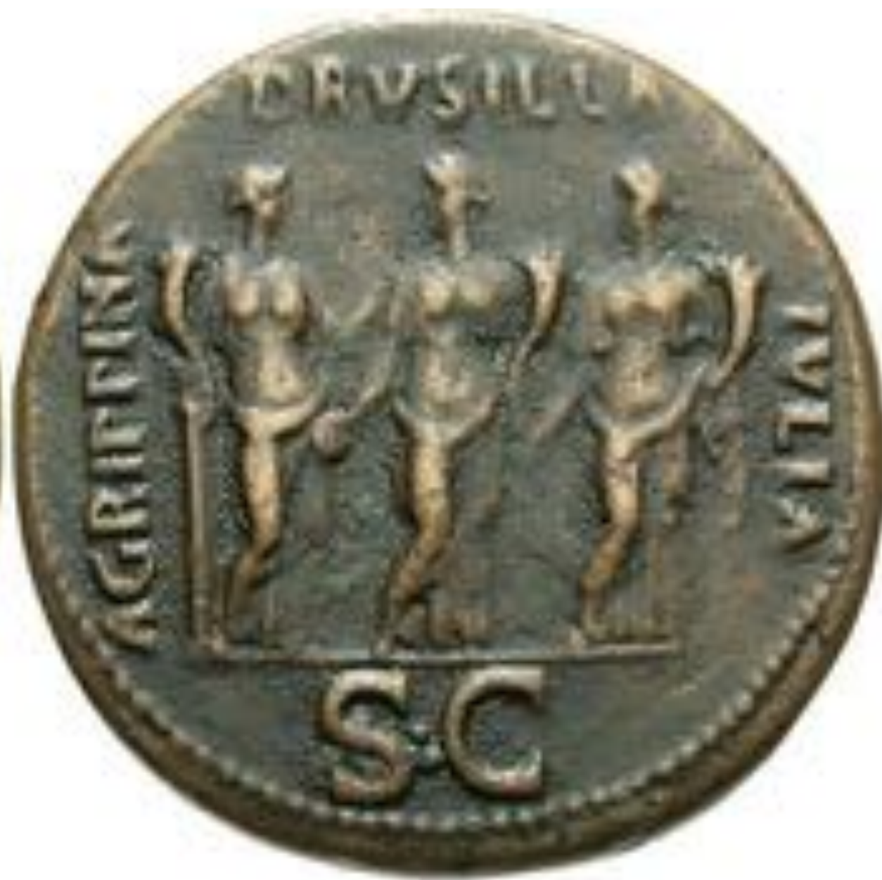
AGRIPPINA DRUSILLA IULIA SC