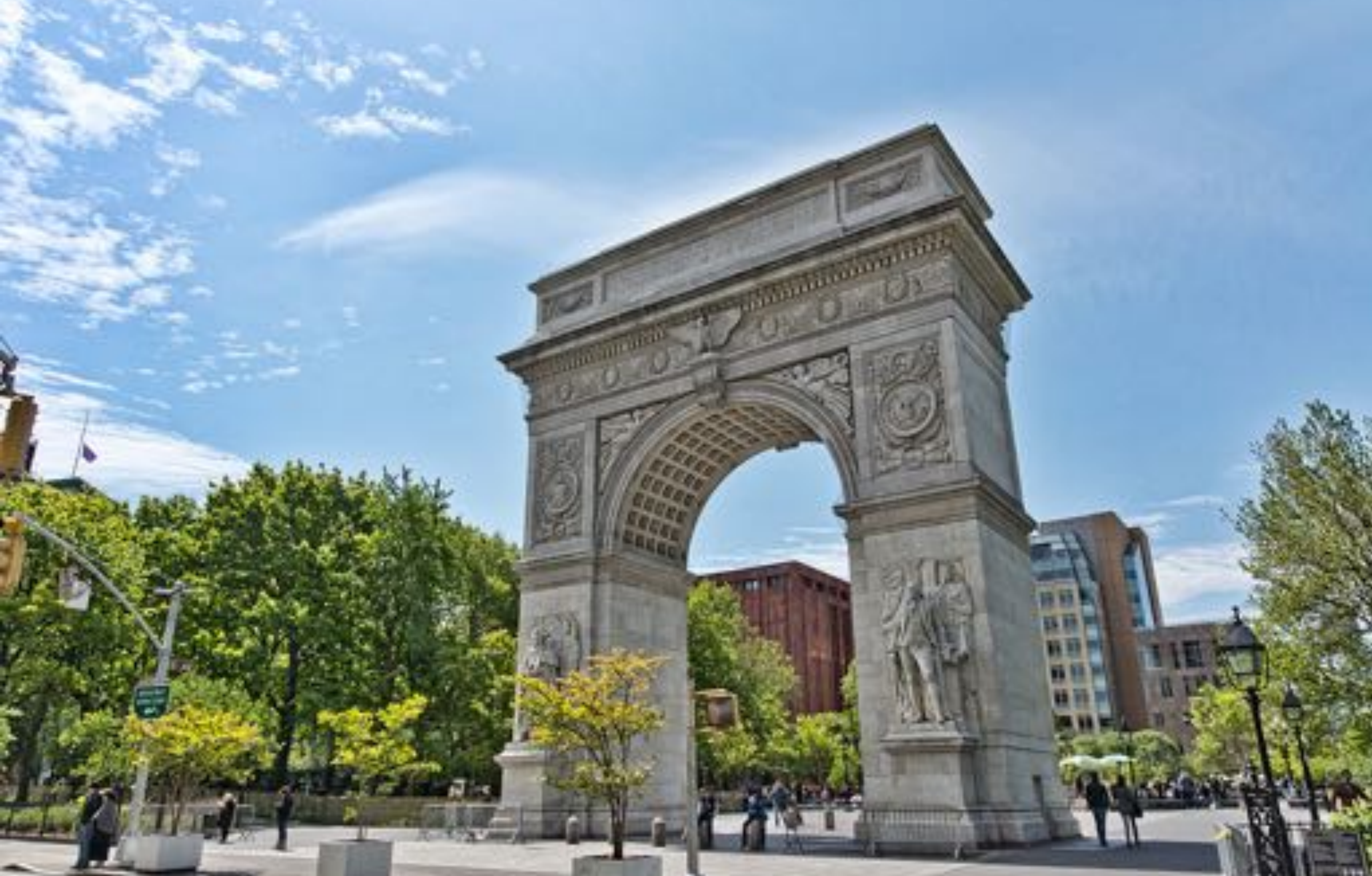
Washington Arch, New York