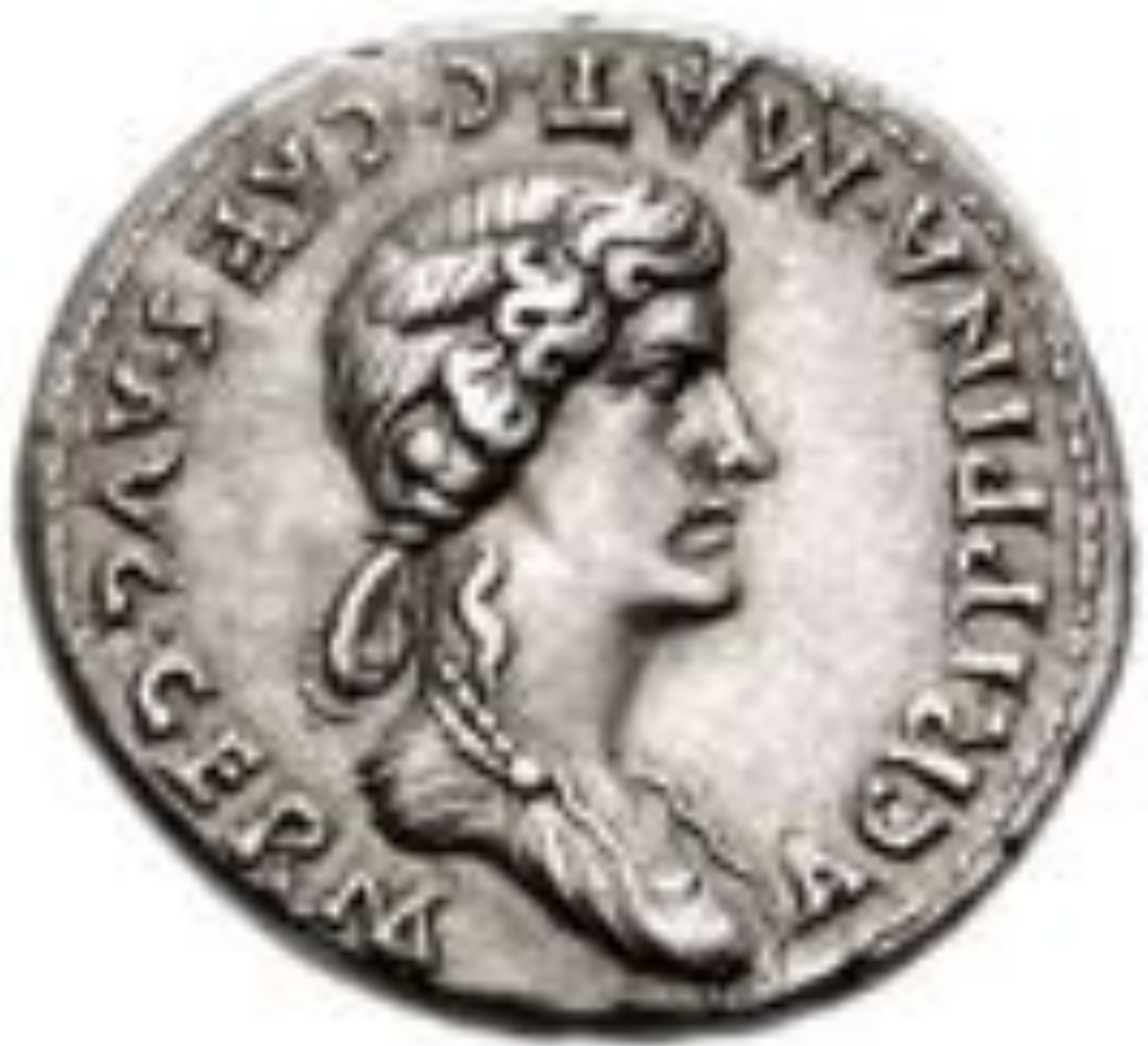
AGRIPPINA MAT C CAES AVG GERM