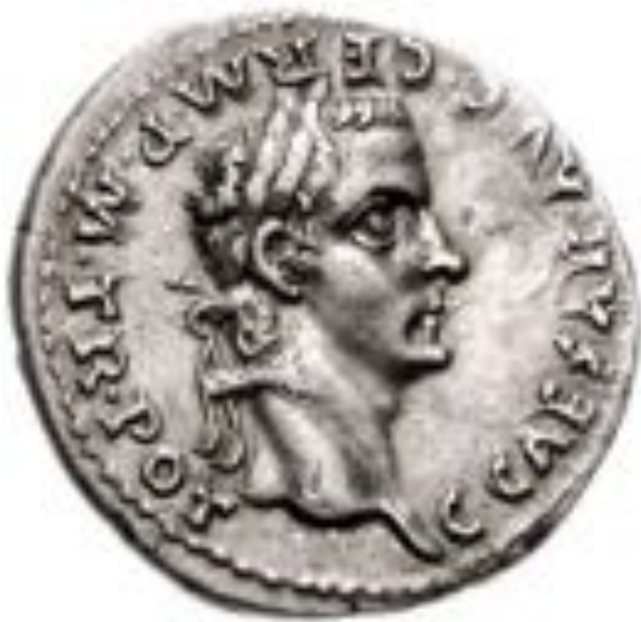
C CAESAR AVG GERM P M TR POT