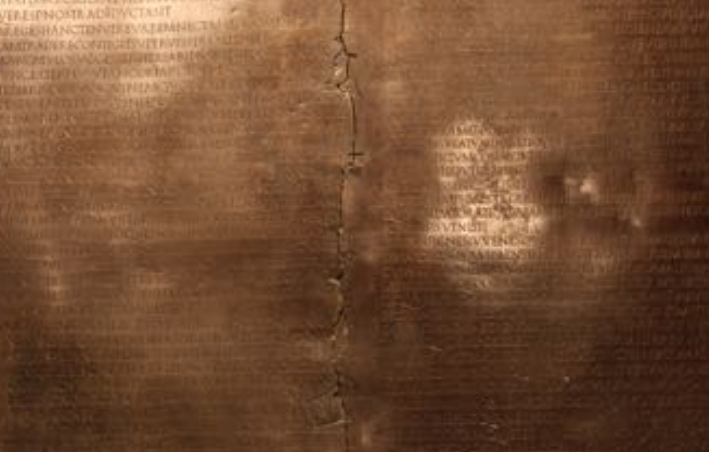
Lyon Tablet, 48