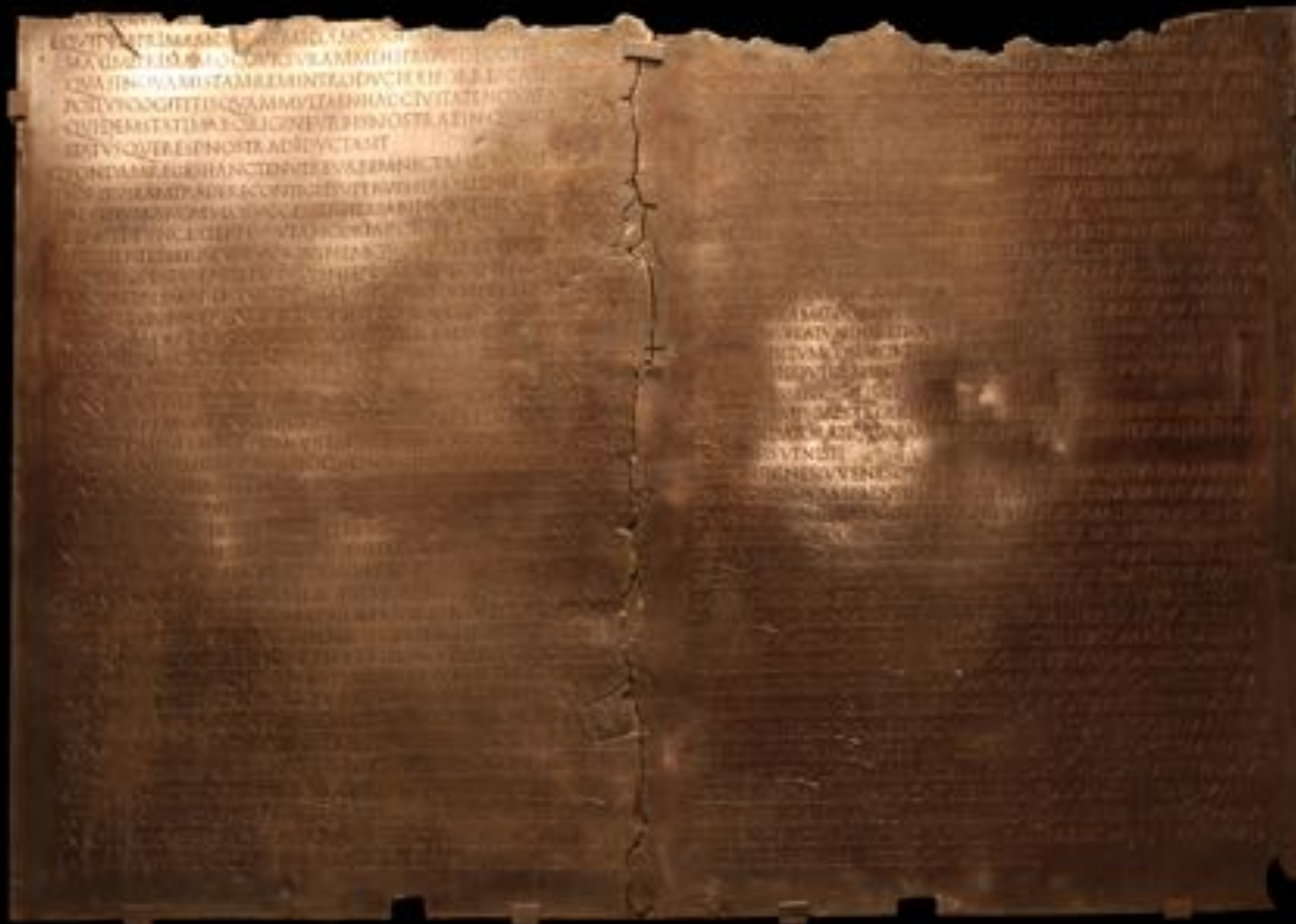
Lyon Tablet, 48