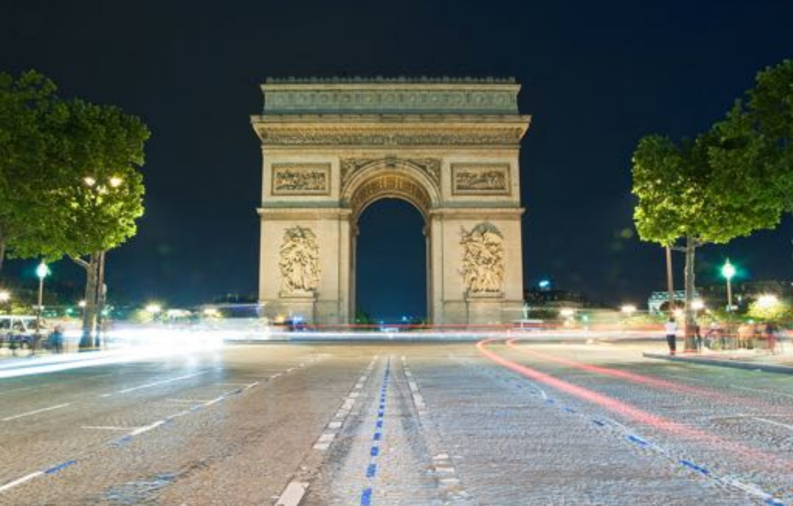
Arc de Triomphe, Paris