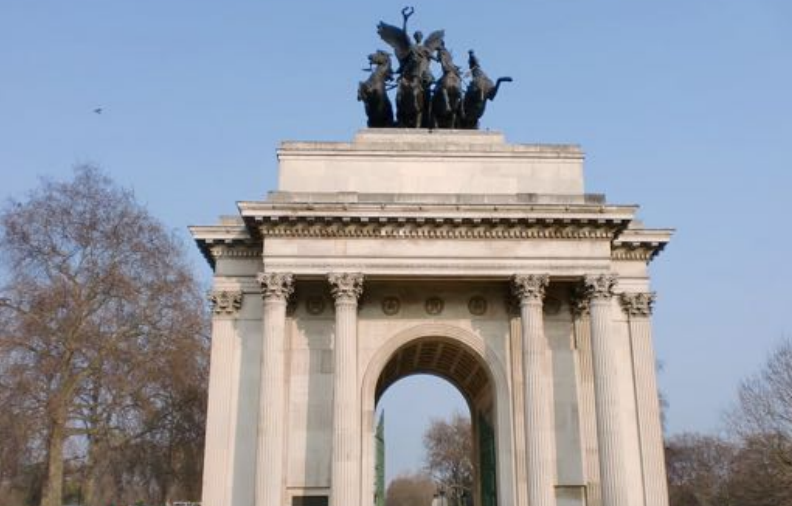
Wellington Arch, London