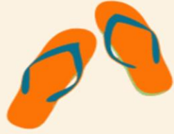
Flip-Flops, Sandals, or Open-Toed Shoes