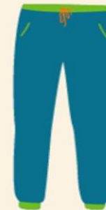
Sweatpants, Leggings, or Jeans