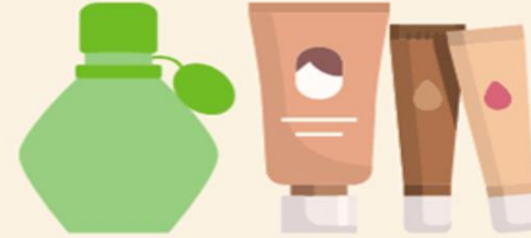
Heavy Make-Up and Perfume