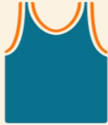
Overly Casual Clothing