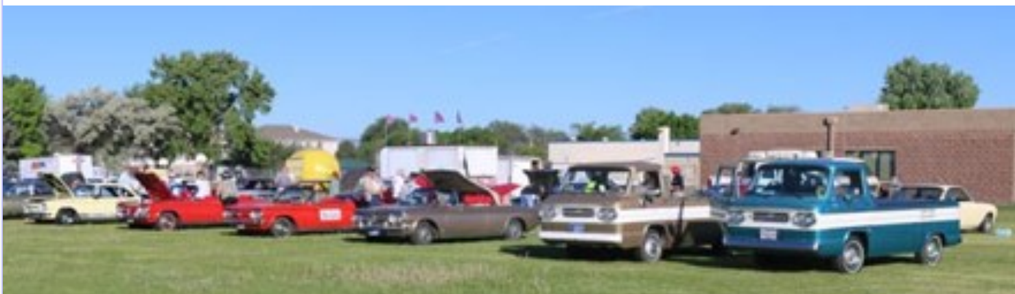
BILL: This photo shows a string of various Corvairs at the car show.