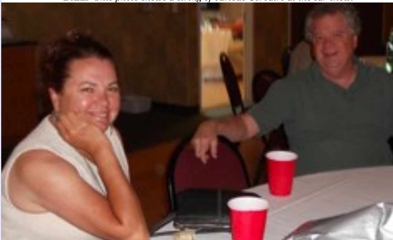
TARMO: Santa Fe was well represented at the Tri-State this year.