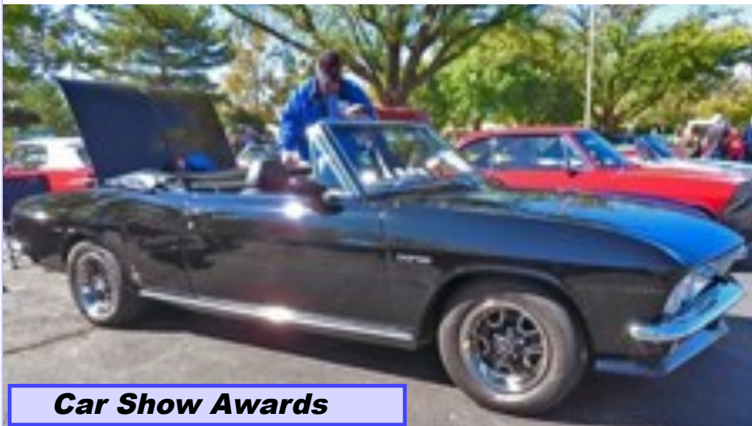
Car Show Awards

That's twenty-four people, maybe only about half of the number of people that it took to get this Tri-State going and running smoothly. I just can't give enough credit to them. It was a great job -- and well done to you all!