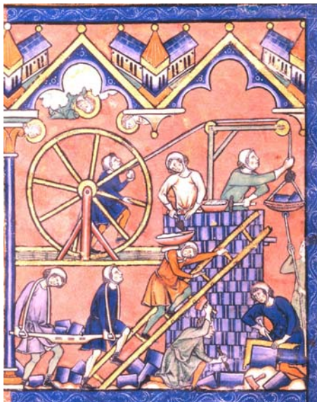
Illustration: The Construction of the Tower of Babel, from the Shah Abbas Bible, ca. 1250. New York, Pierpont Morgan Library, MS M.638, fol. 3r.

A week of lectures and music - free and open to the public Woodward Hall, Room 101