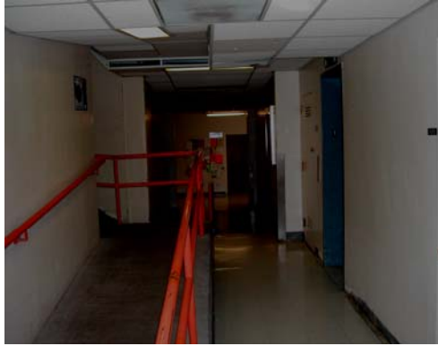
Corridor in Mesa Vista Hall