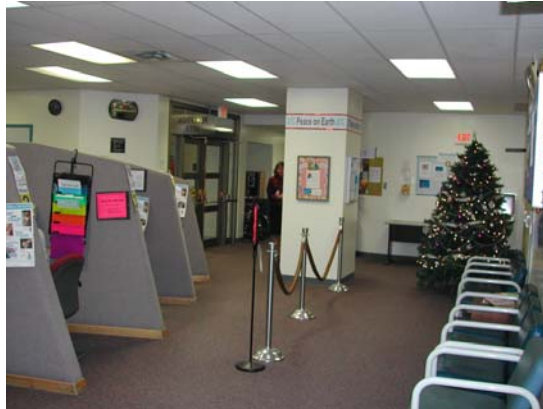
Interior of Student Health & Counseling