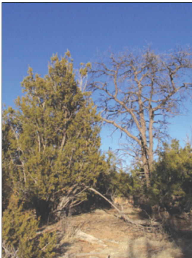
Figure 1. A semi-arid piñon–juniper woodland near Los Alamos, NM, after an unusually warm drought – a global change-type drought – resulted in mortality of piñon pine trees ( Pinus edulis ), while junipers ( Juniperus monosperma ) survived.

designated as the zero assimilation point (Lajtha and Barnes 1991), can be estimated from leaf-level measurements of gas exchange over a range of water potentials. If plant water potential remains at or below the zero assimilation point for a protracted period, metabolic depletion of carbon reserves should eventually lead to tree mortality (McDowell et al. 2008), even though stomatal closure has prevented transport failure.