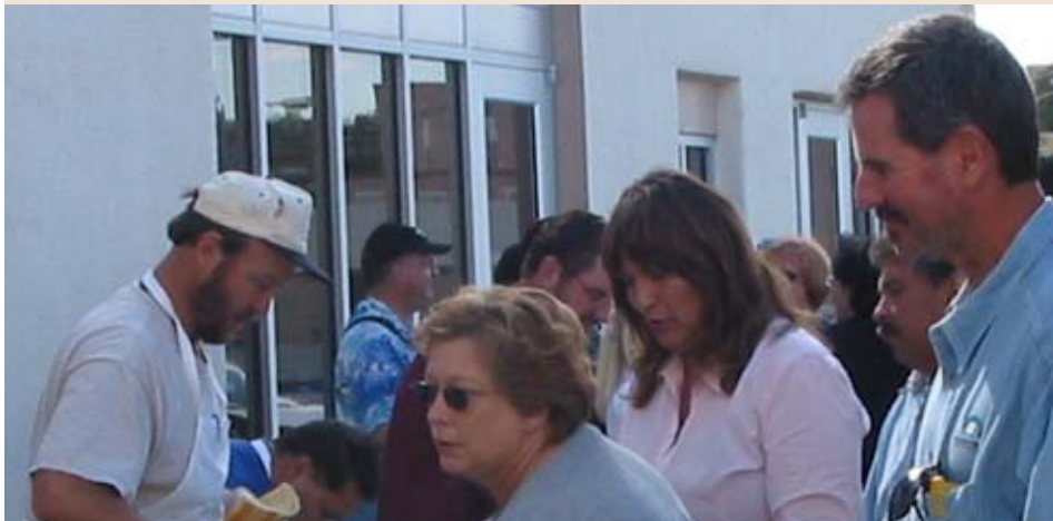
PPD folks are generous and love a good time. Robbs Ribs staff and other members of PPD's business partners serve lunch to PPD staff who purchased a ticket for this event in November 2005.