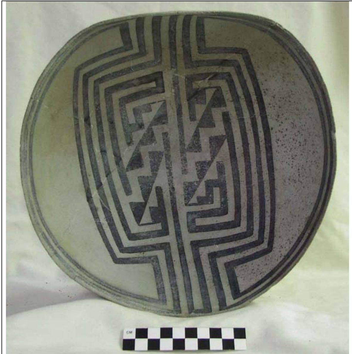
Figure 2. A North Creek Black-on-gray bowl in the collections of the Lost City Museum, Overton, Nevada.