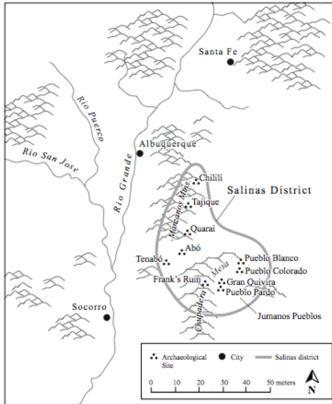
Figure 1. Salinas District Sites. (drawing by Marieka Brouwer)

The early pueblos in this area are called Glaze A pueblos, which refers both to the time period of occupation (during the time when Rio Grande Glaze A pottery was produced, about A.D. 1200-1350) and also to the fact that the first appearance of Glaze A sherds in surface assemblages generally coincides with the architectural form of the masonry plaza-oriented pueblo.