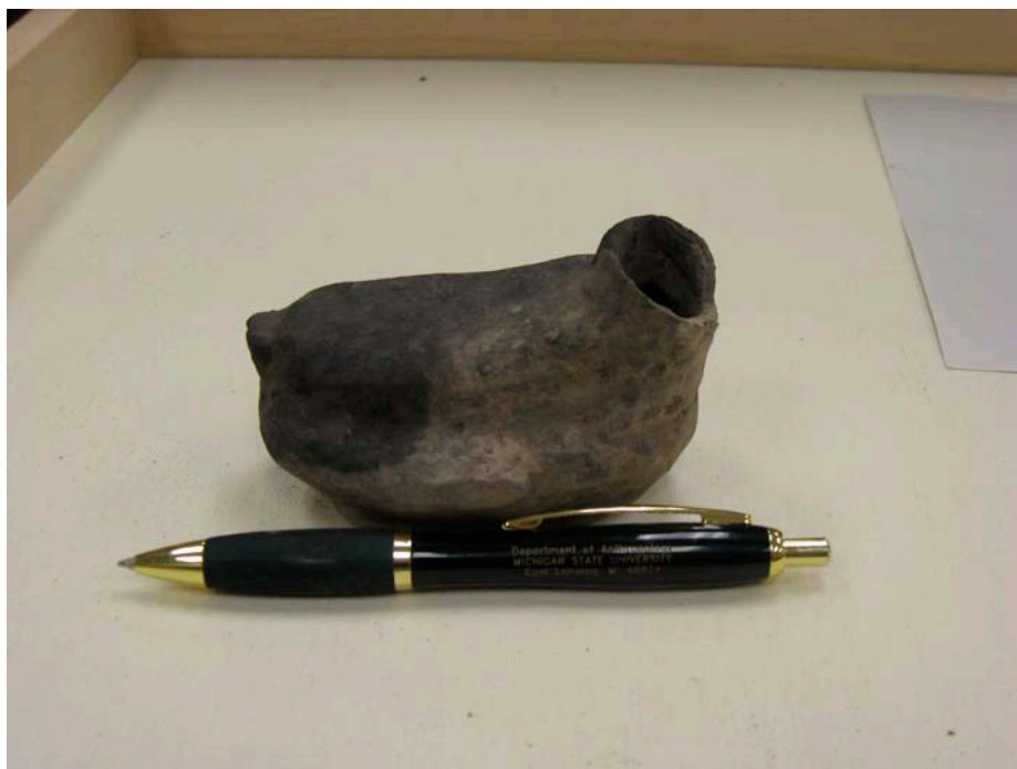
Figure 3. Duck effigy Vessel from LA-9032. Note the painted dots. The pen is 14.5 cm long.

The room floor was uncovered at the base of Level 11; the floor elevation is 97.75. The duck effigy was found approximately 0.56-0.68 m above the floor. We interpreted this context as part of the roof assemblage that had been tipped at an angle and fell into the room when the roof beams burned through.