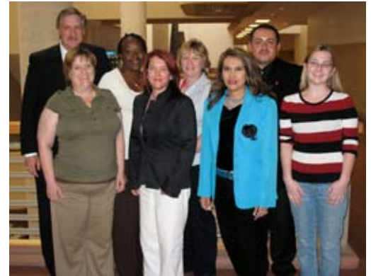
Provost's Committee for Advising members