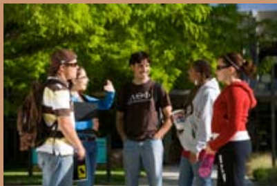
Students at UNM Main campus.