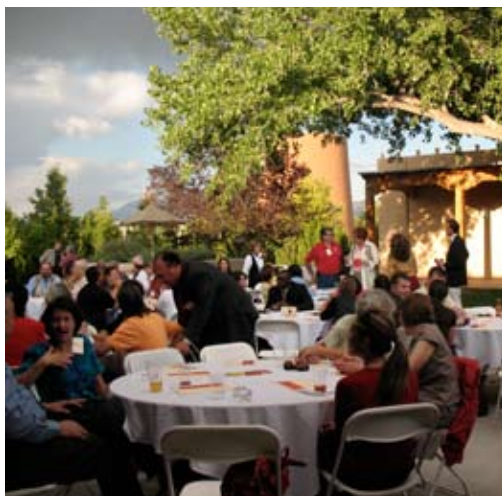
People gather at the Faculty and Community Welcome

I love heading up to the mountains. In my free time I take care of a little dog. I really like to go the movies, go bowling and perform karaoke.