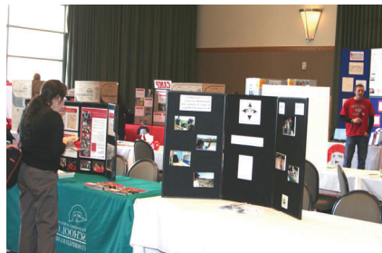
Culture & Identity Showcase, Sharing Best Practices