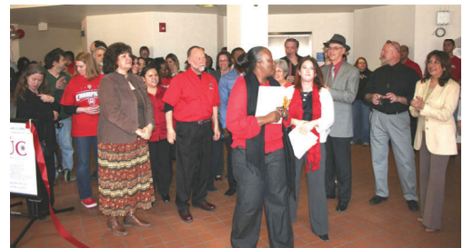
Grand Opening of Advisement & Enrichment Center and LOBO Trax