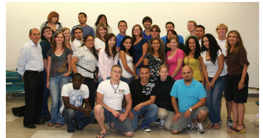
Title V Mentors