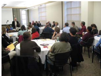
Faculty Institute in November 2007