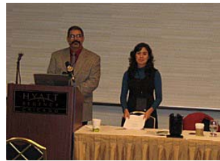
The MAPS team presenting at the 21st Annual HACU conference in Chicago, IL

HACU serves as the professional association for the UNM Title V Program. We were honored to share the MAPS program with other universities and colleges around the globe. Out of numerous UNM proposals to present at the conference, MAPS and the Scholarship Office were selected to present their programs. UNM had a large presence including a University information booth on the main floor.