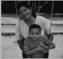
Maid in America

Checkout some of the new films at the WRC