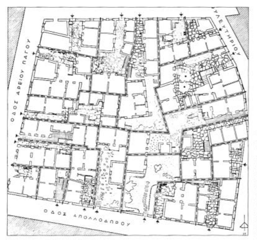
Figure 8. Plans of houses of a complete building hlock. located on the northern side of Arcios Pagos, and demolished far the excavations of the Roman Forum. While a relative tregularity of alignment with the street was maintained on the logades, the interior of the block preserved an intricate property-line pattern of the Ottoman years.

imitating it and adapting it to the needs of the lesser residential structures.<sup>21</sup>