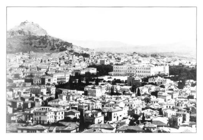
Figure 3, General view of the city, with the royal palace at center right and Syntagma Square in front of it, Mount Lycabetros is at left.

mined by two experts, one representing the owner, and one the city council; and in case of continued disagreement, the value was established by the court.* It is important to note that the focus of planning legislation was on new building. While the language of the law made it clear that sanctions would be imposed on the owners and architects of new buildings that did not conform with the plans, most decrees did not require the alteration of existing buildings. Once the older buildings, eached a point beyond repair, they were to be replaced by new structures that followed the street alignment.