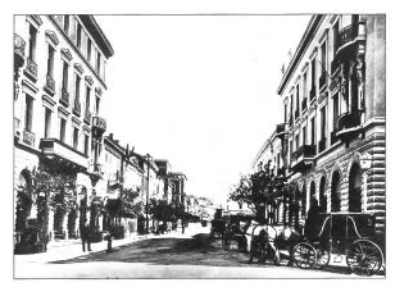
Figure 7. View of Athinas Street, c. 1900, exemplifying the city's modernization.

main boulevards, notably Panepistimiou and Athinas Streets, had indeed acquired the soughtafter European look, the back roads and even the backs of major buildings remained decidedly unglamorous. Even the Neoclassicism of the major civic structures-the palace, the Athenian Trilogy, and the Arsakeion School, among others-was not uniformly applied. Private residences, especially when located far from the center, displayed a rather eclectic stylistic blend. Uneven streets were a perpetual problem, since the planning of Athens was carried out in a piecemeal fashion that addressed each new street opening individually, and lacked an overall leveling program. While the new buildings made a concerted effort at the front to meet the street at a ninety-degree angle, their backs often remembered the street patterns and property lines of ancient, Byzantine, and Ottoman Athens (fig. 8),16