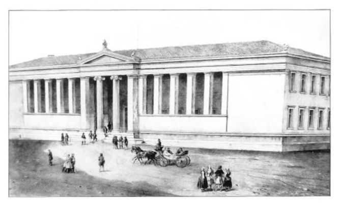
Figure 4. The university building, facing Panepistimiou Street, was designed by Christian Hansen.

contributes to the ethical and material development of the nation (the city council) has decided unanimously to donate the lot (fig. 9.). Similar arguments supported the erection of the national library, which completed the Athenian Titilogy. Terminating at Syntagma (Constitution) Square, the elegant, tree-planted plaza fronting the palace, Parapsistimiou Street symbolically and literally etched the line connecting official cultural production with the monarch's residence (fig. 6.):