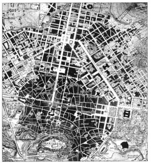
Belonging is a privilege, and has its price. All this is determined by an arbitrary line. What is the nature of this line?