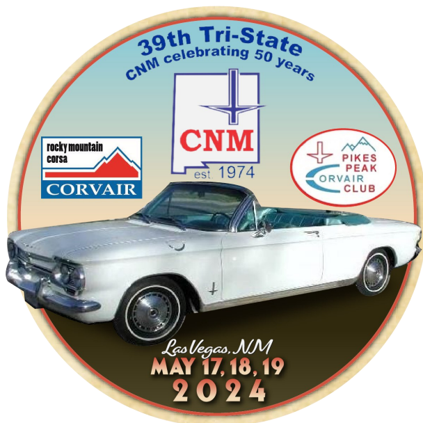
On the Cover: Tri-State Logos –(Top) Back of Shirt / (Right) Front