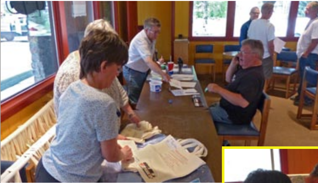
Rugged scenery south of Abiquiú. Stuffing the Registration Bags. Selling T-Shirts and Extra Pins Starting Registration. Visiting in the Hospitality Room.