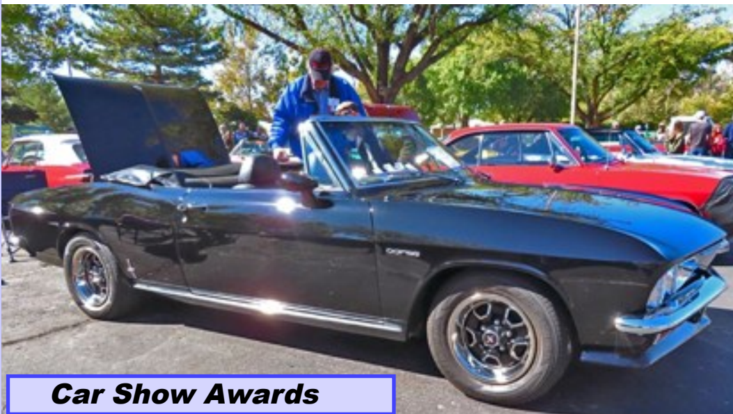
Car Show Awards

That's twenty-four people, maybe only about half of the number of people that it took to get this Tri-State going and running smoothly. I just can't give enough credit to them. It was a great job -- and well done to you all!