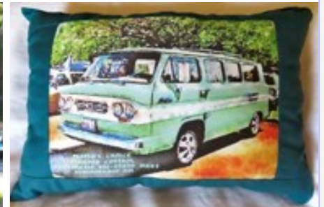
Forward Control TWE-020 Diane Tweedy-Lawler Rocky Mountain 1963 Rampside Turquoise/White