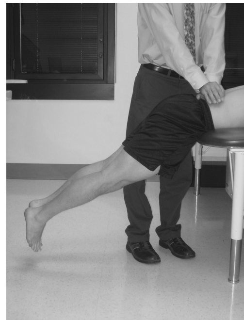
Figure 1. Prone instability test: In this test, the patient is prone, with legs off the table and feet on the floor. The clinician applies posterior-anterior pressure over the lumbar spine and assesses for pain. The patient then engages extensors and lifts feet off the floor. The test is positive if pain is elicited with pressure and relieved with active extension, as this is thought to indicate temporary pain relief through stabilization of the spine (22).

Research on core stability exercises has been hampered by a lack of consensus on how to measure core strength. If core instability and core weakness can be measured, outcomes can be followed and a proper emphasis can be placed upon core strengthening in certain individuals. Delitto and others